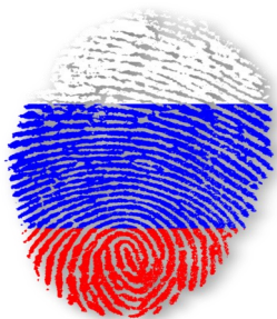
Political Risk Advisory: Russia