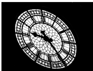
The Sleaze of doing business

inflammatory a statement, consider some examples drawn from just the past few months of projects that have crossed the KCS desk. An instance whereby a client asked for due diligence on a potential partner with no supporting information to assist in validating him – not even a passport. An instance of investigating a fraud with the client's shell-shocked amazement that the deal could have gone wrong. And an instance where, having been told some very concerning derogatory information, the client requested this to be removed from the report that would decide the CEO's position.