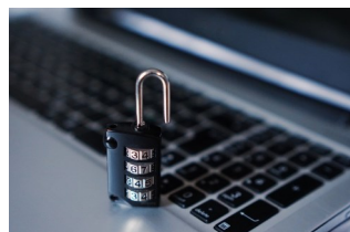
Cyber-Psychology: The underestimated threat