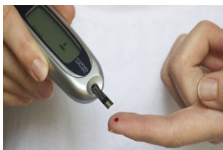
Thernos the mad Titan?